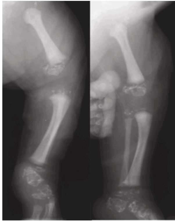
Figure 1. Radiographs from a female infant with CDPX2 demonstrating epiphyseal stippling (also called chondrodysplasia punctata; punctate epiphyseal dysplasia)