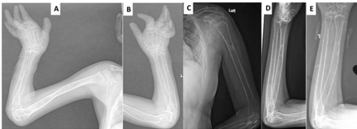
Figure 6. Radiographs of the long bones of the upper extremities in affected individuals at ages 6 years (A, B) and 13 years (C, D, E). All cases demonstrate decreased bone mineralization with cortical thinning.