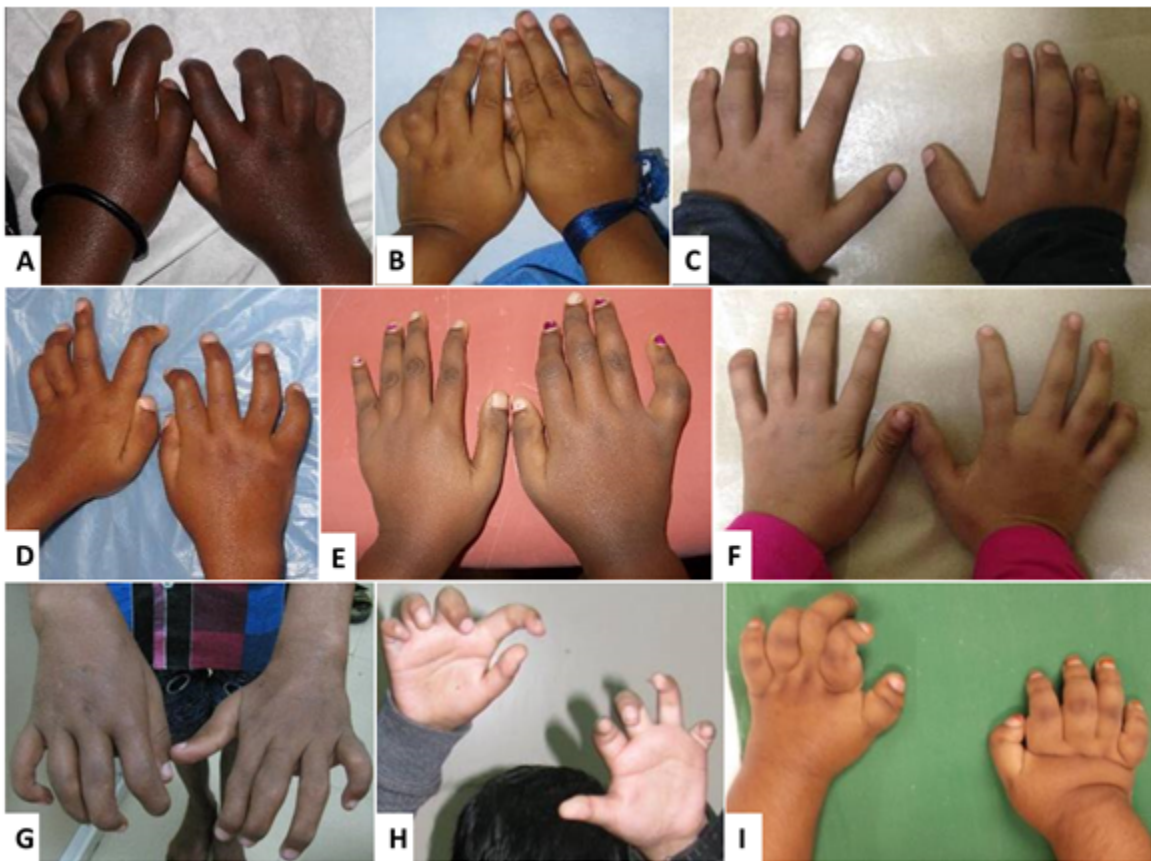
Figure 1. Hands of different children with MONA showing joint contractures and swelling of the digits at age 4 years (A), 5 years (B), 7 years (C,D), 9 years (E), 10 years (F), 13 years (G,H), and 15 years (I).