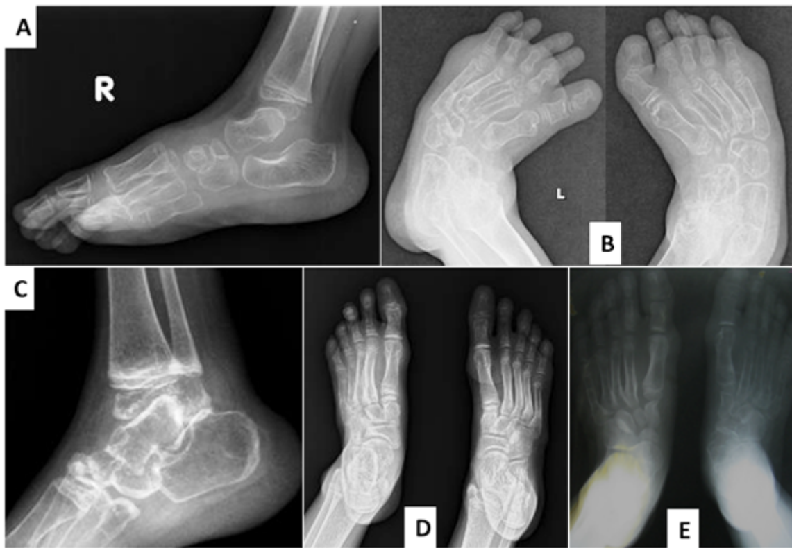
Figure 5. Radiographs of the feet of affected individuals at ages 5 years (A), 6 years (B), 7 years (C), 9 years (D), and 13 years (E). All cases demonstrate diffuse osteopenia. Small tarsal bones for age with irregular margins, particularly in (C) and (E), are reflective of osteolysis.