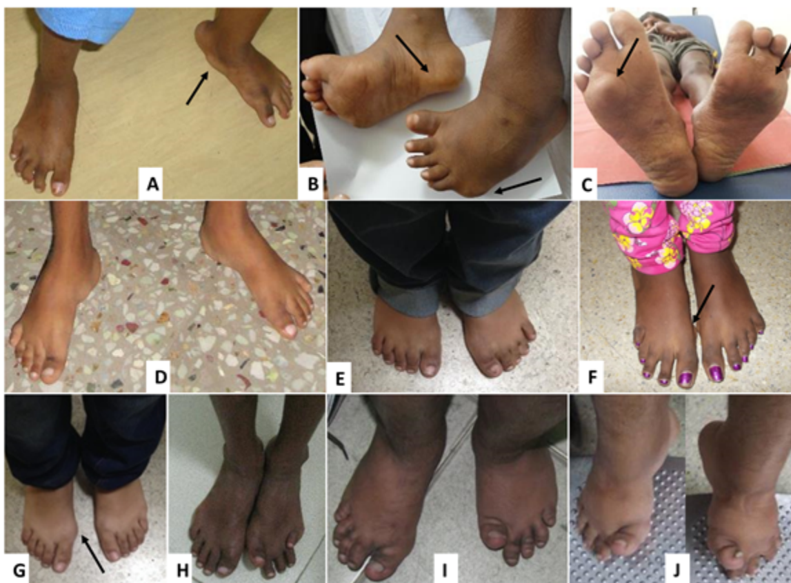
Figure 2. Feet of different individuals with MONA at ages 5 years (A), 6 years (B,C), 7 years (D,E), 9 years (F), 10 years (G), 13 years (H,I), and 15 years (J). Subcutaneous nodules are seen in A, B, C, F, G (arrows).