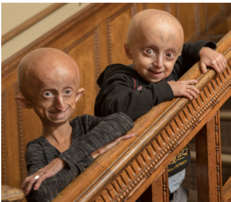
Figure 1. Female age 11 years and male age six years with HGPS displaying classic features